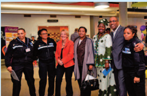
Black History Month 2014: The Police and Crime Commissioner's Office and the Black and Asian Police Association co-hosted a multi-cultural community fun day at the Lighthouse Centre

We will review the effectiveness of our victim service arrangements after 12 months.