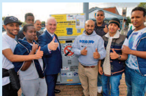
PCC David Jamieson with Samson Road residents at the launch of the Sparkbrook Knife Surrender Bin

We monitor public perceptions of safety and policing with independent local surveys and national crime surveys. We want to see fear of crime as reported in these surveys affecting fewer and fewer people.