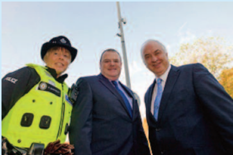
Sandwell CCTV Camera Project supported by the Commissioner's Invest to Save budget

More than one in five recorded crimes are committed against businesses. We will look to develop our understanding of business crime, while working with businesses and other partners to reduce overall business crime. We will look closely at how best to work with businesses to tackle specific crimes such as making off with fuel without paying (often called “bilking”).