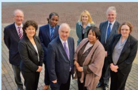
West Midlands Strategic Policing and Crime Board

The Strategic Policing and Crime Board supports holding the Force to account. The Board's diverse membership ensures we can engage across the West Midlands and also supports setting of strategic direction for West Midlands Police.